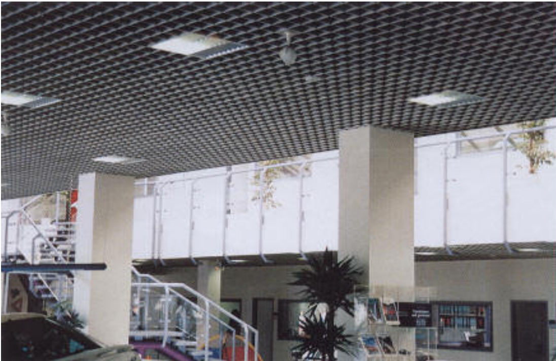
SACHSENGARAGE, DRESDEN, GERMANY